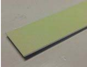
Alu Strip Front View