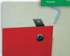
600123 Clip installed on 600001 Unframed Sign