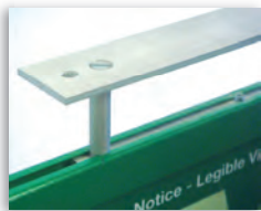
600055 Bracket inside 600026 Framed Sign